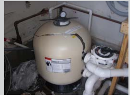
Pool was not winterized properly resulting in a cracked filter tank and plumbing lines.